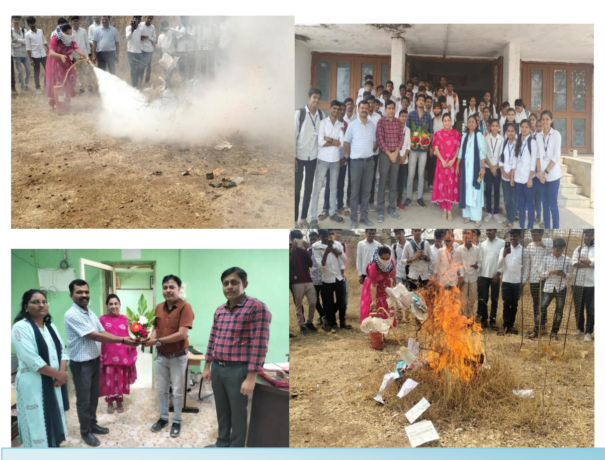
National safety Day 04/03/2023 celebrated in Chemical engg department