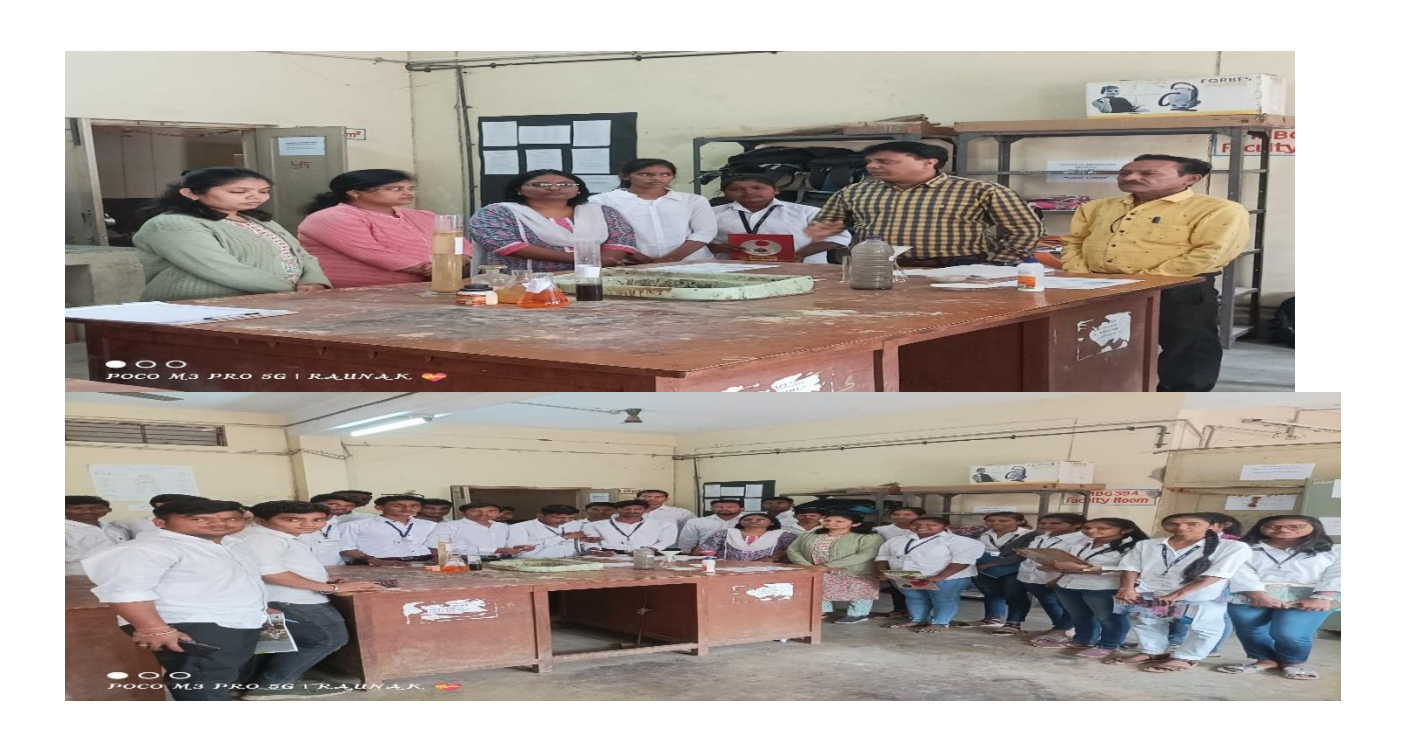
Environment tech practical workshop for civil engg students 12/10/2022